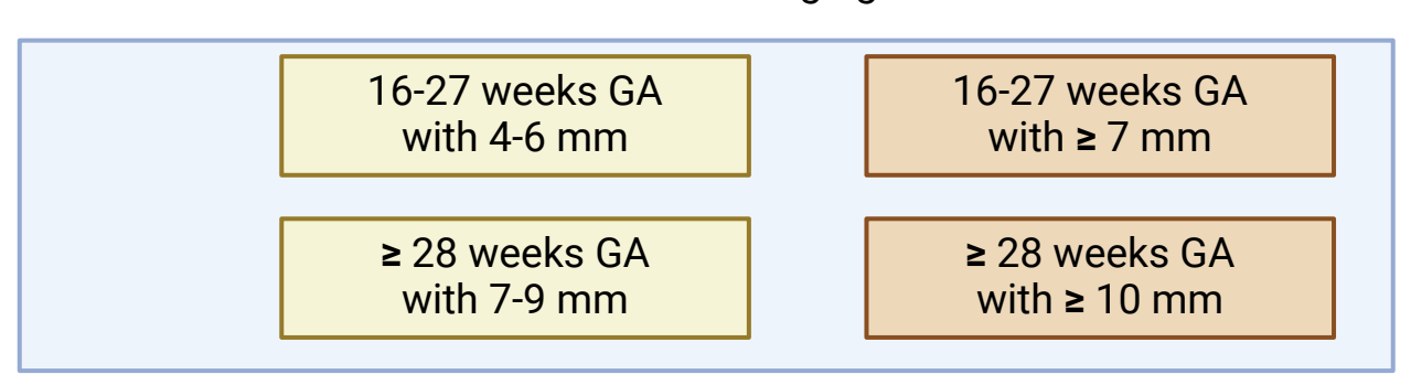
++ If there are any questions or concerns, please page Pediatric Urology ++

For Reference: UTD APRPD staging/measurements